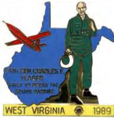
1989 V Green Flight Suit