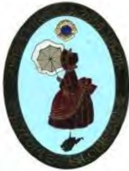
2006 New Orleans