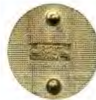
1999 Lioness HO-Ho Trademark