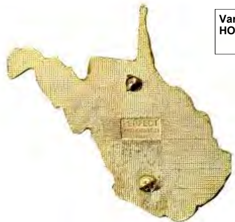
1999 P Perfect Trademark