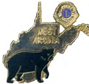
1980 V-2 Black