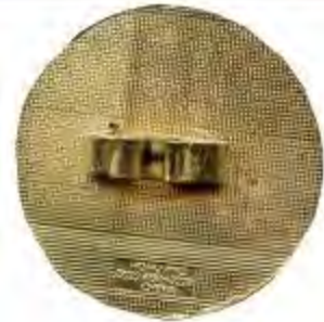
1998 Limited Edition Bolo