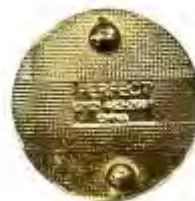
1999 Lioness Perfect Trademark

Variation of Prestige and Lioness Pins. They were originally marked HO-HO. They were reordered and marked Perfect on the reverse.