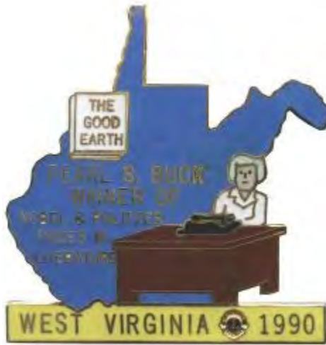
1990 V Blue Hair