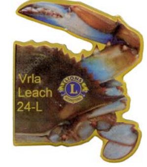
WW 0000 20 Vrla Leach (VA) Right Half of a Crab

NOTE: The two pins above, when joined together, form a complete crab, as shown to the right FYI..