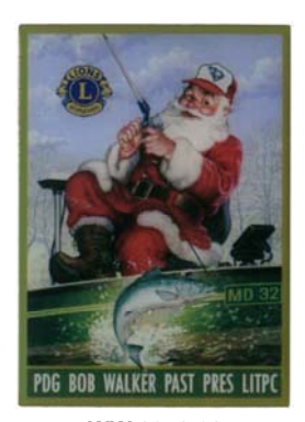
WW 0978 20 Bob Walker (SC) Santa Catching a Salmon

NOTE: This is the 6th Santa Catching Fish in an eventual 8 pin set.