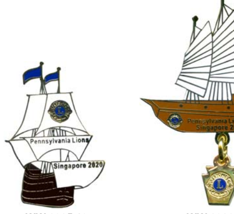
WW 0985 19 WW 0986 19 MD 14 Pennsylvania Regular Issue Prestige Issue