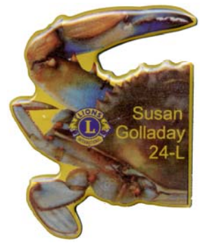
WW 0000 20 Susan Golladay (VA) Left Half of a Crab

NOTE: The two pins above, when joined together, form a complete crab, as shown to the right FYI..