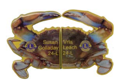
The crab in reduced size.