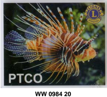
WW 0984 20 Ohio Pin Traders Lion Fish

NOTE: This the final pin in a 6 pin set of exotic fish pins issued by the PTCO. The complete set, in reduced size, is shown to the right FYI.