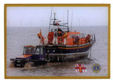
WW 0938 19 John Leggett (UK) "The Lincolnshire Poacher"

NOTE: This is a Skegness Lifeboat launch, which is accomplished by a motor vehicle. There is a lifeboat at a station about 50 to 100 miles apart all around the UK. This particular station is in the town of Skegness in the county of Lincolnshire.