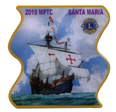
WW 0964 19 Massachusetts Pin Traders The Santa Maria