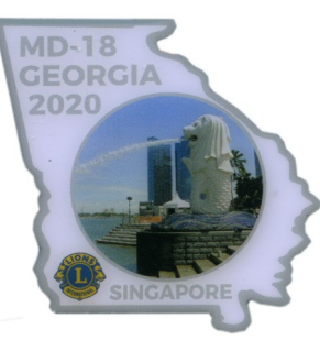
WW 0960 19 MD 18 Georgia MerLion Statue in Singapore Bay