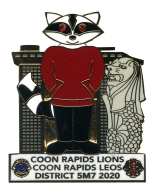
WW 0967 19 Coon Rapids Lions & Coon Rapids Leos MerLion Statue

NOTE: This pin would not normally qualify for inclusion in this catalog. However, it is one of a two pin set and we feel you might like to have the set.