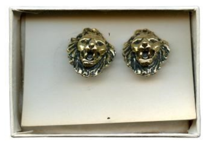
Lions Head Cuff Links

NOTE: The give-away items shown herein are merely samples of those that have been used by Lions over the years and is in no way intended to reflect the total number of such items.