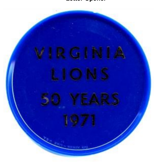
1971 Beverage Coaster