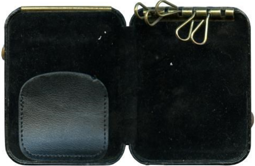
Key Holder (Shown Closed and Open)