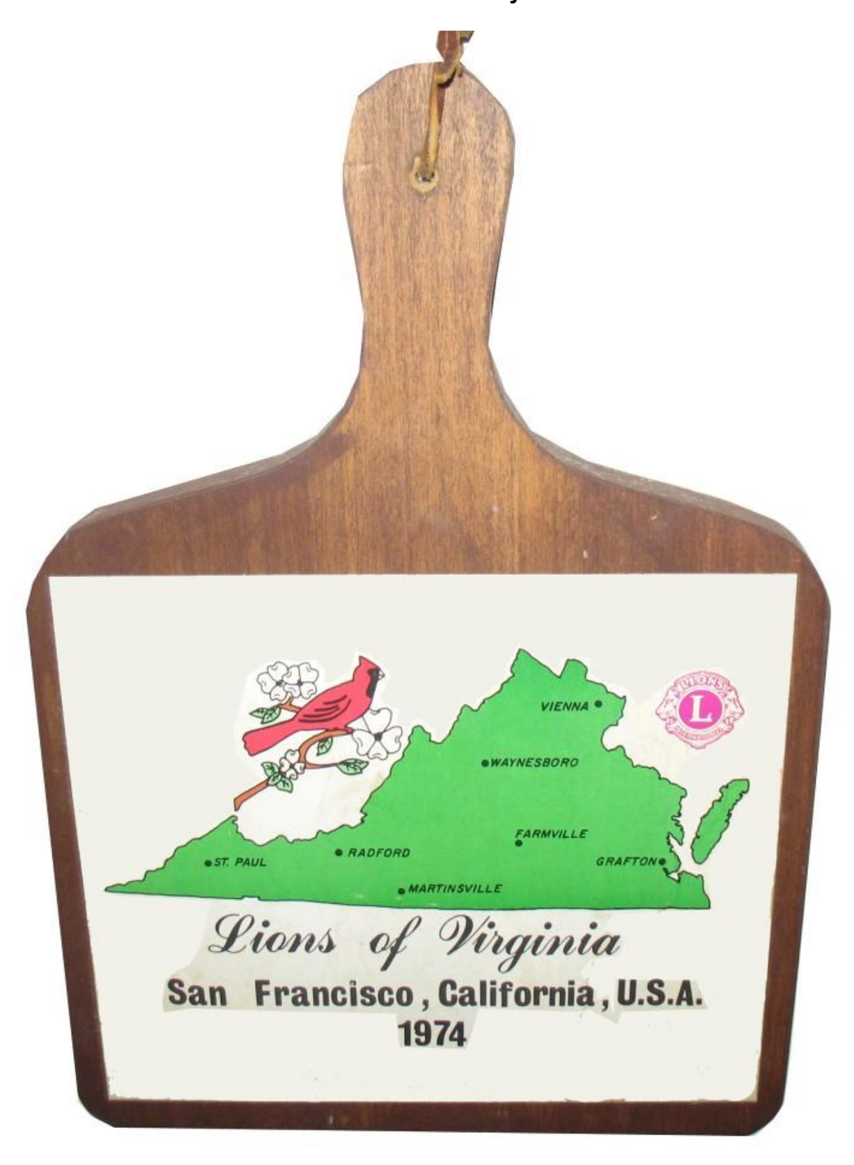
VIRGINIA - MD 24 Miscellaneous Give-Away Items

1974 Bread Board (Reduced to fit on the page)