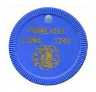
1949 Poker Chip