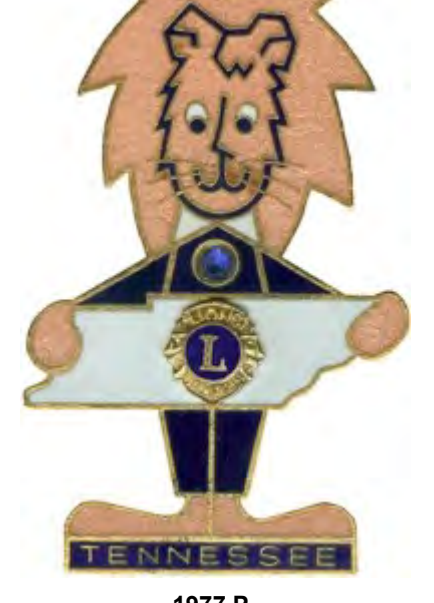
1977 P Blue Stone