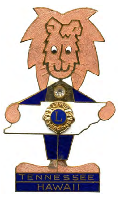
1976 Origin Unknown White Stone Hawaii on Base

NOTE: Several Tennessee Lions removed the blue stone from the 1972 pin and inserted a red stone in its place. There was NO prestige pin in 1973.