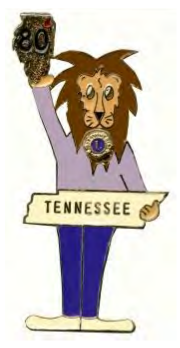
1980 Origin Unknown Probably a Sample