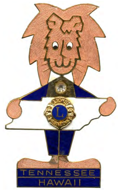
1976 P V White Stone Hawaii on Base