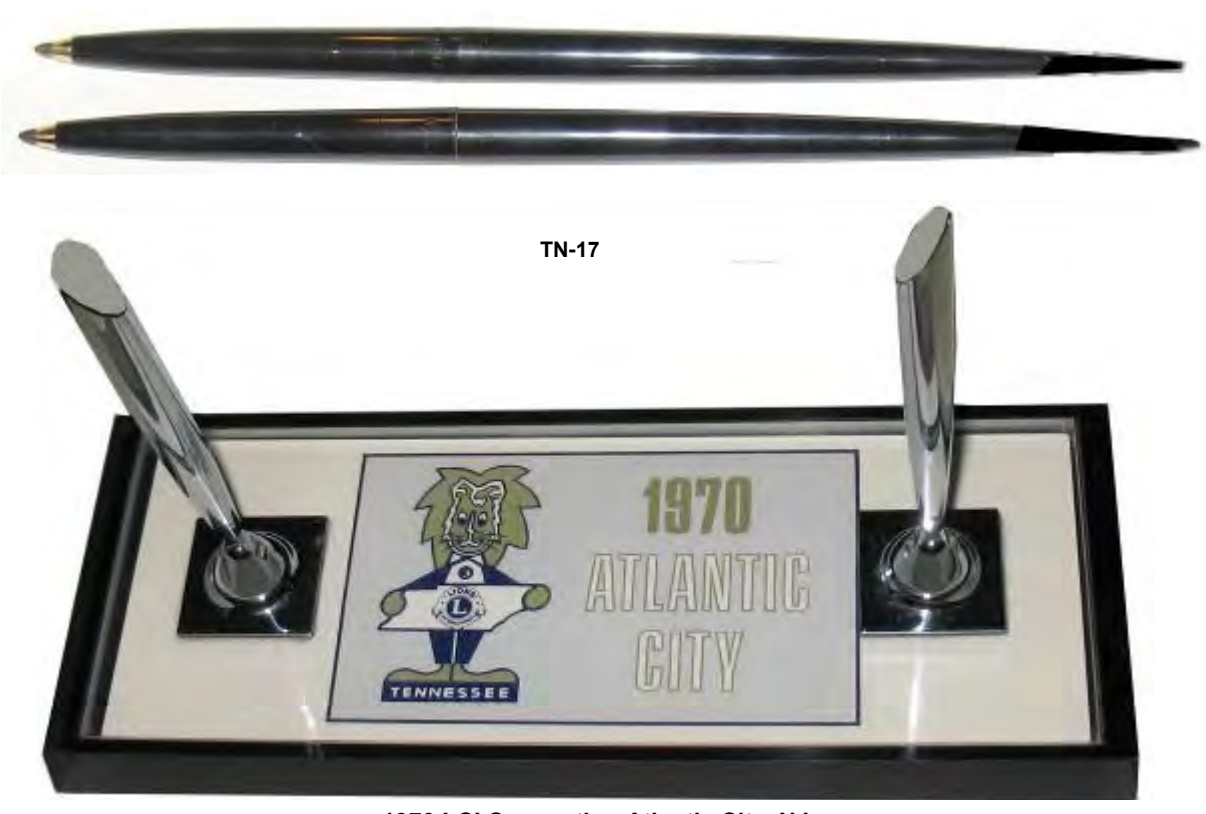
1970 LCI Convention Atlantic City, NJ