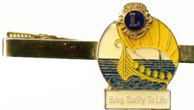
1986 Tie Clasp