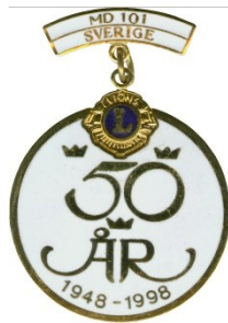
1998 Special 50 Years of Lions