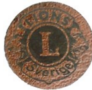
2023 Special 70 Years of Lions