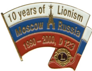
2000 Special 10 Years of Lions