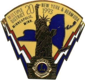
1993 Red Stripe