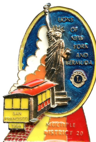
1984 P Light Blue Background Bright Yellow