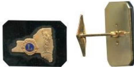
1984 Cuff Links