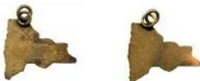
1964 Charm (Reverse)

The above two examples of the backs of the 1964 Charm showing that the loop is on the back of the pin rather than the top. There is no evidence of a solder so it is assumed that this was created by the factory.