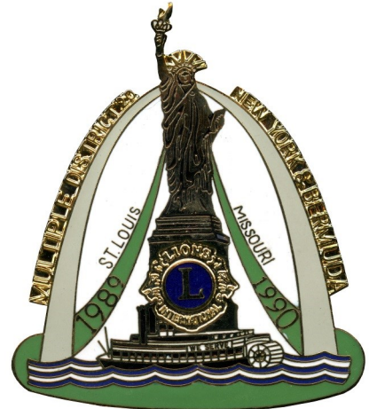
1990 P V Gold Border