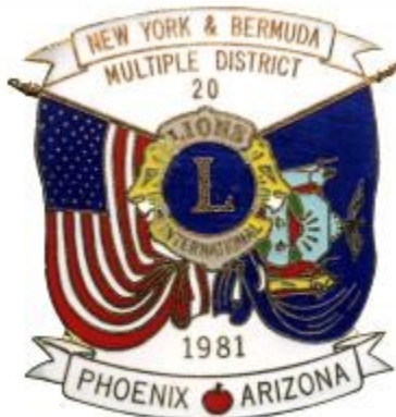
1981-1 V Bright Red Stripes & Apple