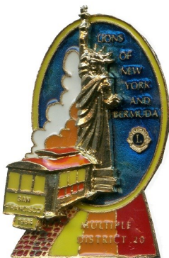
1984 Light Blue Back- ground Bright Yellow Strip