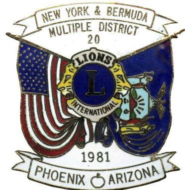
1981-2 White Apple