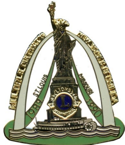
1990 V Gold Border