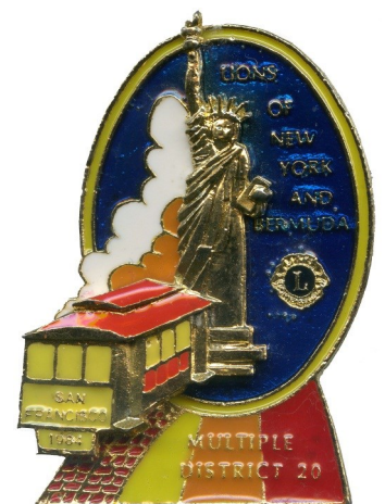
1984 P V Dark Blue Background Dark Yellow Strip