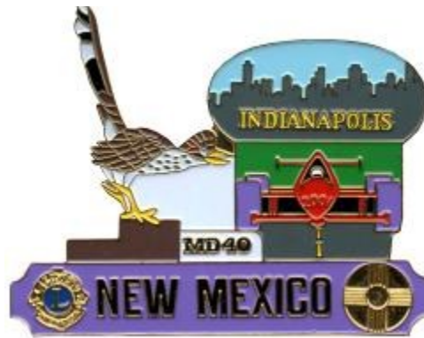
2001 P (With M-40)