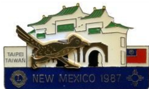
1987 V Minimal Epoxy