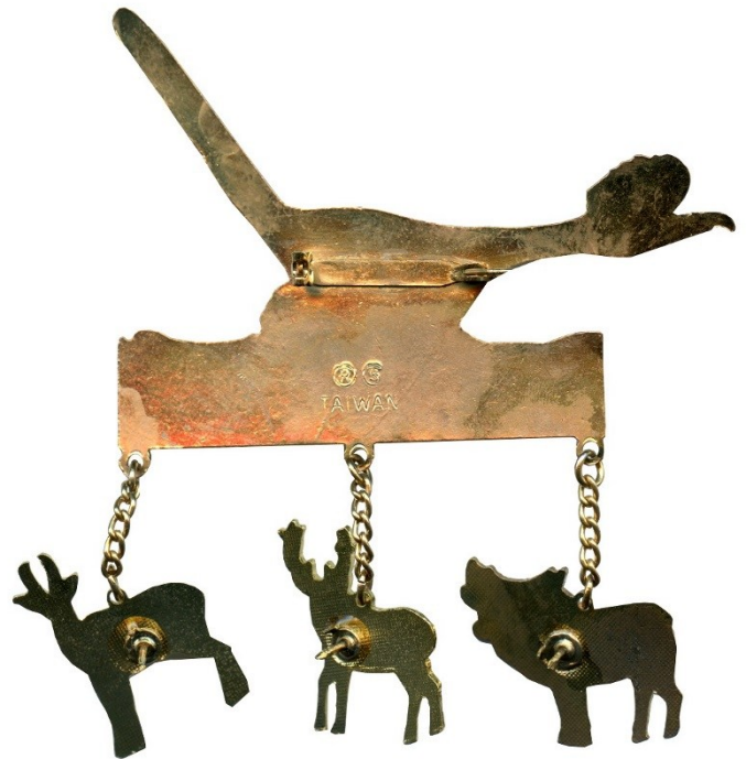
1981 P Reverse (Gold)