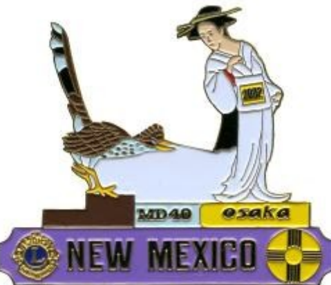
2002 P (White Kimono)