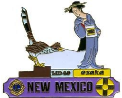
2002 P (White Kimono)

NOTE: All of the pins on this page were traded at the international conventions as the actual prestige pins from NM. In reality they were not approved by the MD 40 Council of Governors but were instead issued by a PDG who had moved from another state and was the same person responsible for the 1999 non-approved issues. These pins are in most collections as the prestige pins for the years shown and are recognized by most pin traders as the actual issues for those years since they were and still are traded as such. These facts are being revealed in writing for the first time.