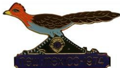
1974 Remake Etching on soft enamel with epoxy