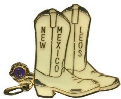
Leo Date Unknown

Beaded shoes on ribbons were early items given away by the Lions of New Mexico at International Conventions. The example on the right has "New Mexico" stamped on the head. The example on the left and center have "New Mexico. District 40" There are several different versions of these probably made by many different Lions for the conventions. These are highly collectable.