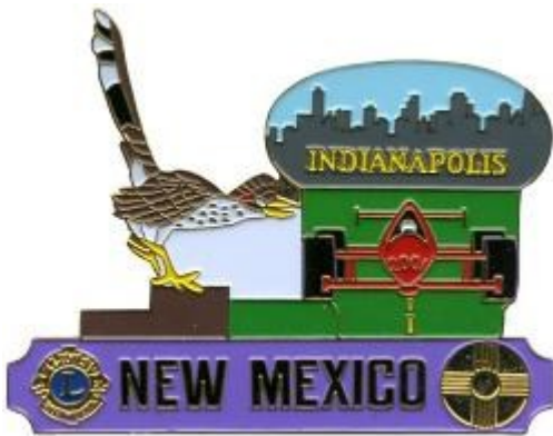
2001 P (Without M-40)