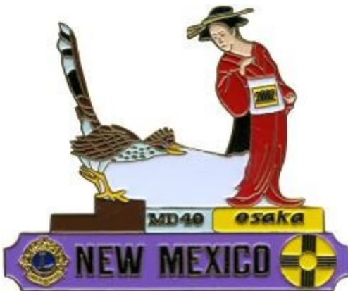
2002 P (Red Kimono)