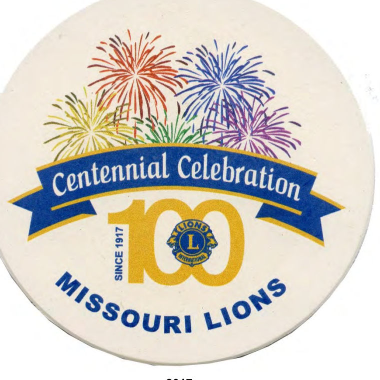
2017 Centennial Celebration Gift Ceramic Coaster