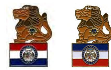
This Lion on the Missouri flag was made by a PDG in Missouri. The only difference in the two pins is the placement of the color stripes.