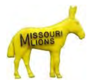
1961 (Black Letters)