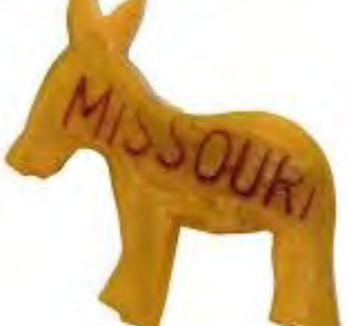
1960 V (Red Lettering)