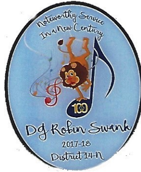
MN-0355 DG ROBIN SWANK 14-N 2018