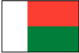
Republic of Madagascar Flag

Djibouti officially the Republic of Djibouti , is a country located in the Horn of Africa . It is bordered by Somalia in the south, Ethiopia in the southwest, Eritrea in the north, and the Red Sea and the Gulf of Aden in the east. Across the Gulf of Aden is Yemen .