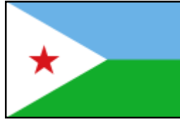
Republic of Djibouti Flag

Covers the area of Mauritius, Mayotte, Republic of Djibouti, Republic of Madagascar and Reunion