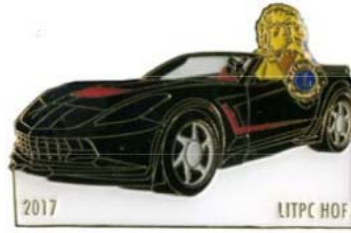
Bill Prucha (IL) Class of 2008