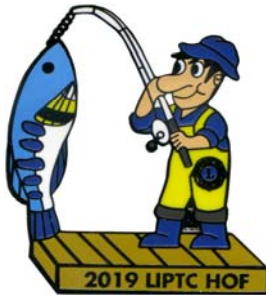
Curt Barnhill (NC) Class of 2015