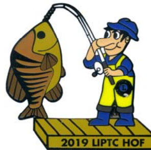
Joe Trezza (CA) Class of 2012