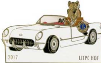
Curt Barnhill (NC) Class of 2015