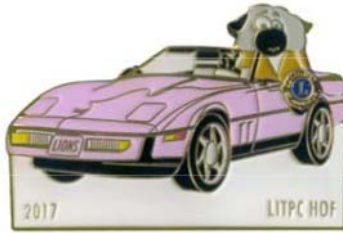
Gene English (NC) Class of 2007