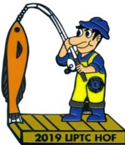
Jim Schiebel (NY) Class of 2011