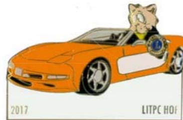
Bill Sour (CO) Class of 2016