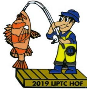
Gene English (NC) Class of 2007