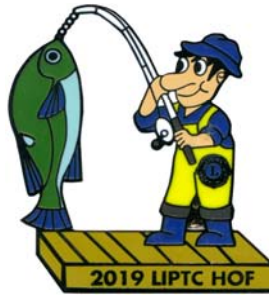
Bill Sour (CO) Class of 2016