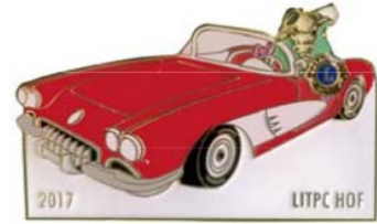
Jim DeRouche (TX) Class of 2006