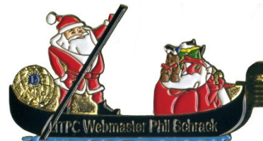
Phil Schrack (VA) Webmaster WW 1100 20