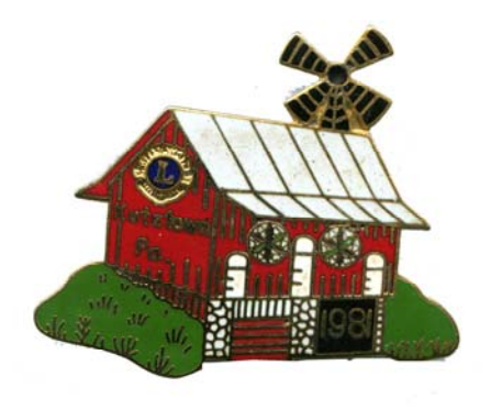
1981 Pennsylvania Dutch Barn