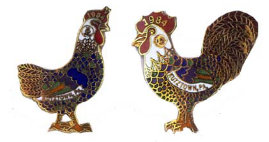
1984 Chicken and Rooster