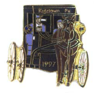
1997 Amish Buggy