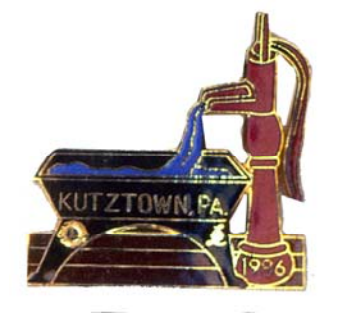
1986 Water Pump