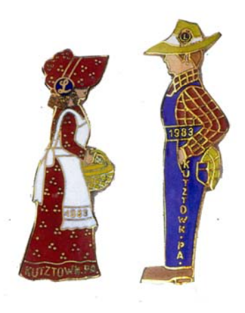
1983 Farm Lady and Farmer