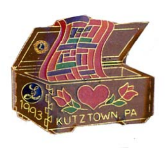
1993 Blanket Chest