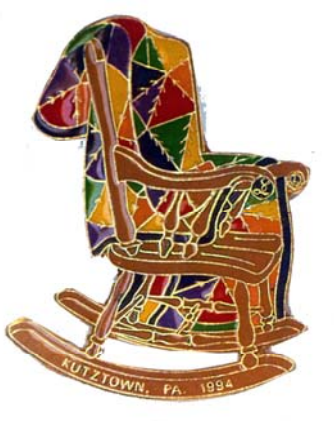
1994 Rocking Chair