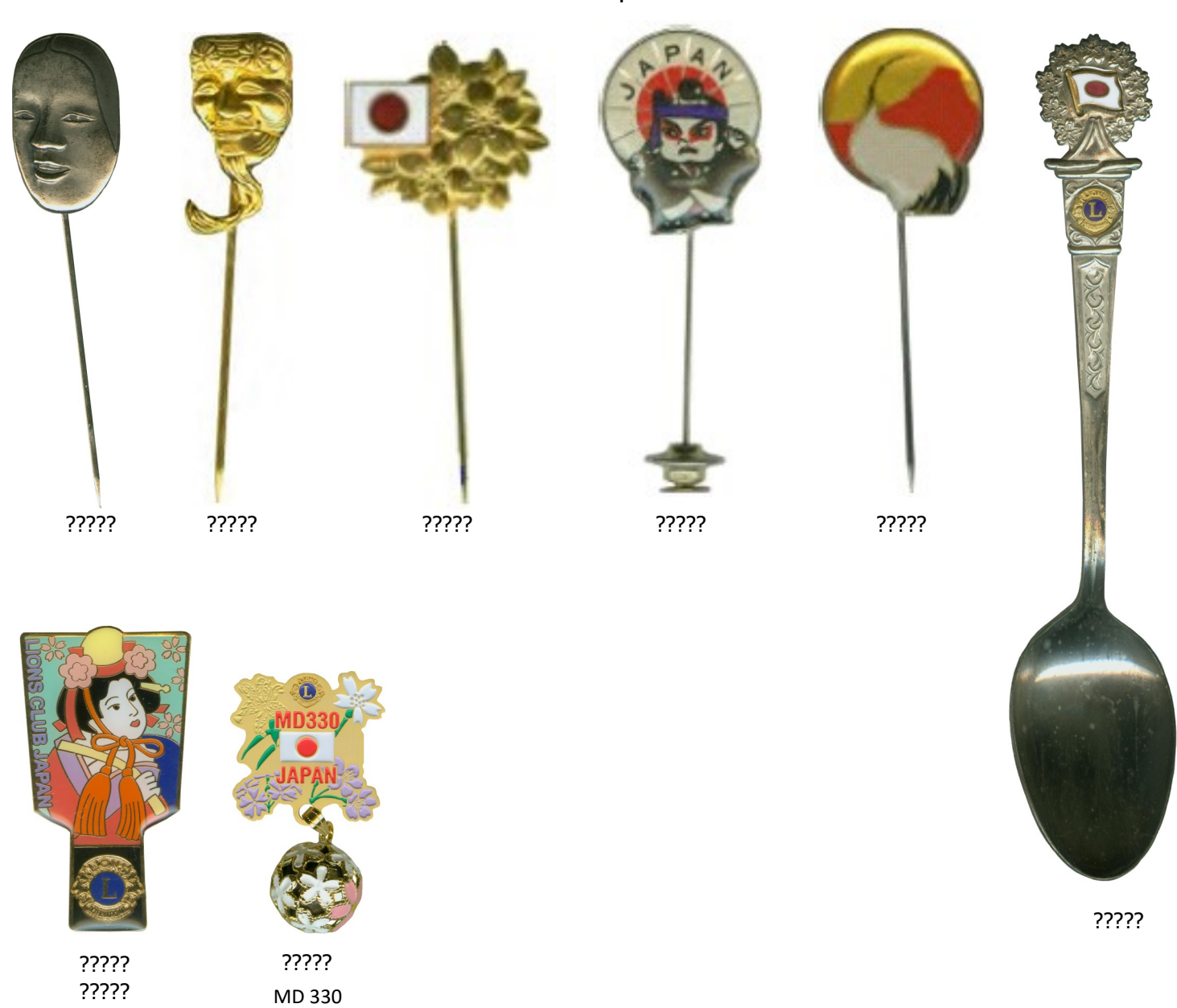
Japan MD-302 & Japan Pins