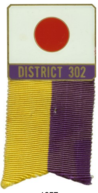
1957 MD 302

A yellow split tail ribbon is normal attached to this pin