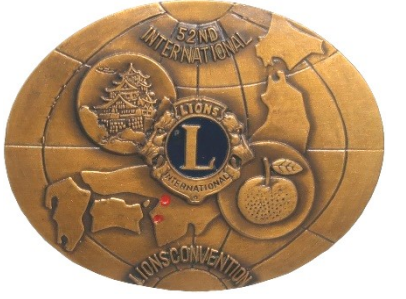
1969-5 MD 302