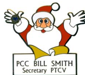
HS 1450 15 Bill Smith (VA) Secretary PTCV

NOTE: Small version of HS 0096 13 on page HS-10