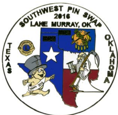
HS 1472 15 Southwest Pin Swap 2016 "Happy New Year"