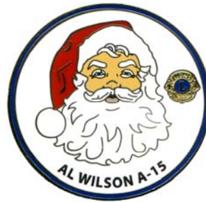
HS 1414 15 Al Wilson (CAN) Dark Blue Rim