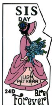
HS 1451 15 Pat Kerr (VA) Half of Puzzle Pin

NOTE: Small version of HS 0096 13 on page HS-10