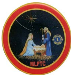
HS 1461 15 Mississippi Pin Traders The Nativity Scene Red