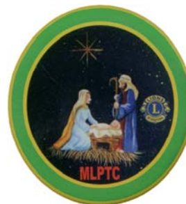
HS 1463 15 Mississippi Pin Traders The Nativity Scene Green