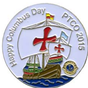
HS 1458 15 Ohio Pin Traders Happy Columbus Day