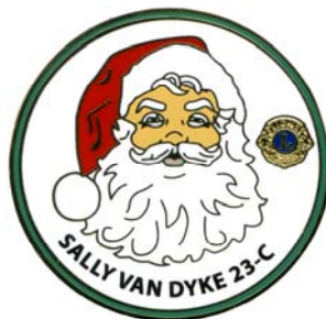
HS 1413 15 Sally Van Dyke (CT) Dark Green Rim