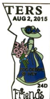
HS 1452 15 Debbie Ivey (VA) Half of Puzzle Pin

NOTE: This is what the two pin puzzle looks like when joined.