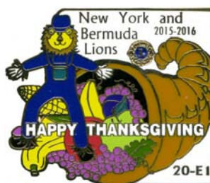
HS 1459 15 New York & Bermuda Pin Traders Happy Thanksgiving