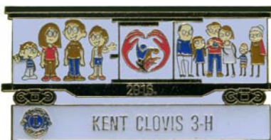
HS 1481 15 Kent Clovis (OK) Happy Best Friends Day August