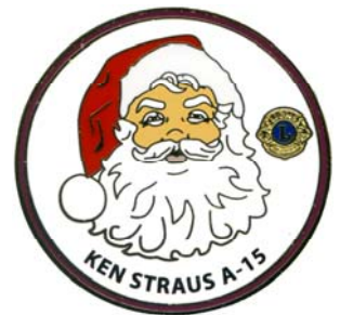
HS 1412 15 Ken Straus (CAN) Dark Purple Rim