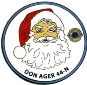
HS 1405 15 Don Ager (NH) Light Blue Rim