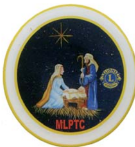
HS 1462 15 Mississippi Pin Traders The Nativity Scene Red