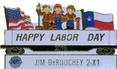
HS 1482 15 Jim DeRouchey (TX) Happy Labor Day September