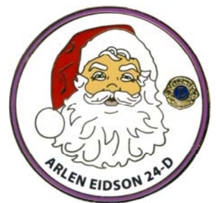
HS 1408 15 Arlen Eidson (VA) Purple Rim