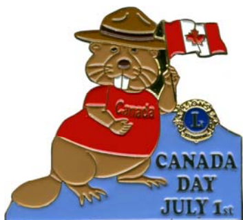
HS 1454 15 Mark Mahovich (CAN) Happy Canada Day July 1st Light Blue