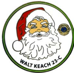
HS 1410 15 Walt Keach (CT) Green Rim