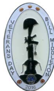
HS 1460 15 Bill Middleton (OK) Veterans Day