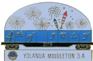
HS 1480 15 Yolanda Middleton (OK) Happy Independence Day July