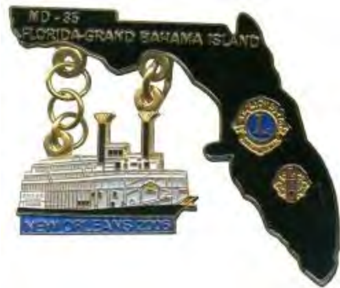
2006 New Orleans