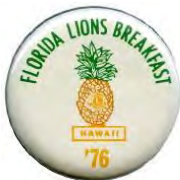
1976 Breakfast Button