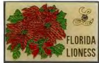
Florida Lioness Unknown Date