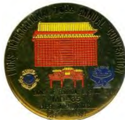
1987 Special - 1