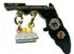
2006 New Orleans