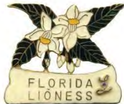
Florida Lioness Date Unknown