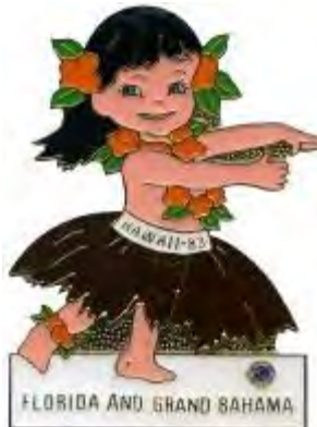
1983 V-2 Color