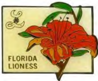
Florida Lioness Unknown Date