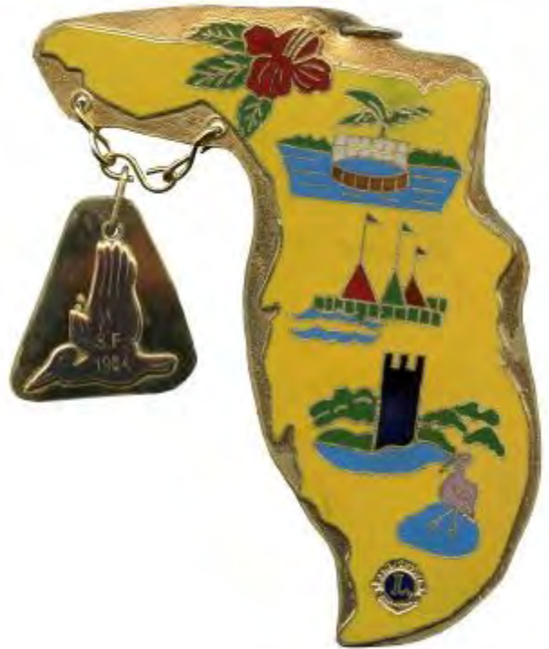
Multiple District & District Puzzle Pin Set