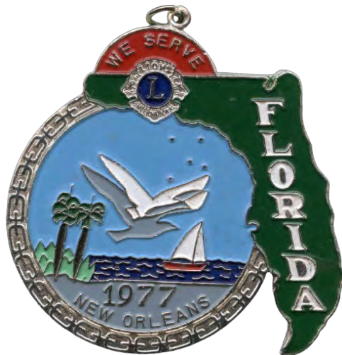
1977-2 Silver Medallion