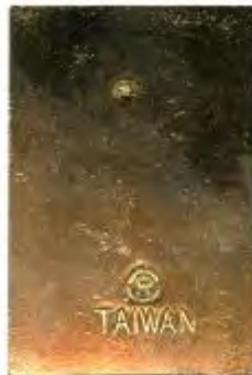
Smooth Reverse Large "Taiwan"