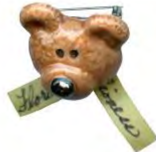
Florida Lioness Unknown Date