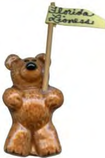
Florida Lioness Unknown Date