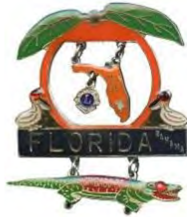
1981 V (Red Stone Eyes)