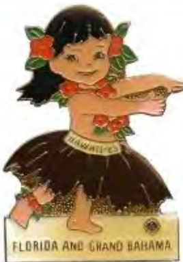
1983 V-1 Color