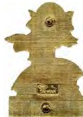
1983 V-1 & V-2