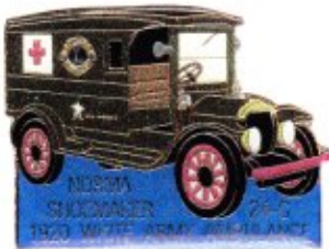
NORMA SHOEMAKER 24-C