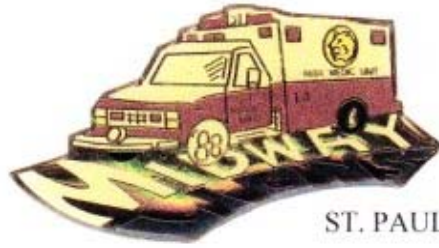
ST. PAUL MIDWAY 5M6