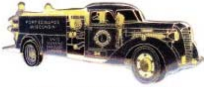
PORT EDWARDS 27-A1