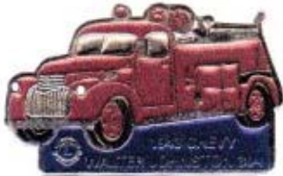
1943 CHEVY WALT JOHNSTON 30-I