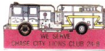
CHASE CITY 24-B