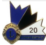
2009 Image Enlarged