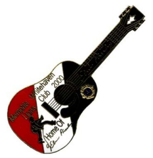
2000 Miniature Prestige Red, White & Blue