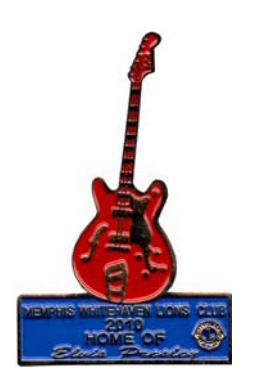
2010 Red Guitar

The Elvis Presley Guitar sets shown below are the first pin of a new Elvis Presley set which started in 2010. The size of the pins are 1 1/8" wide by 1 3/4" High.