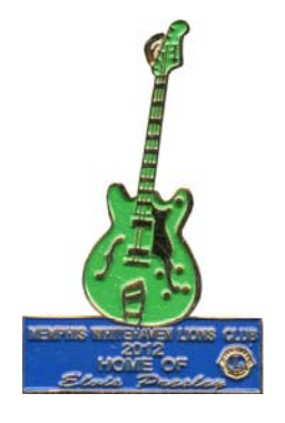
2012 Green Guitar