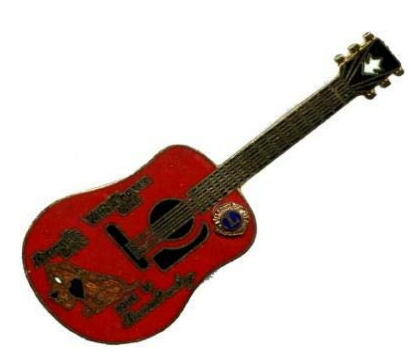
1979 Red Hound Dog