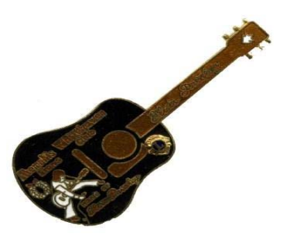
1977 Black (with Wreath the year Elvis Presley died.)