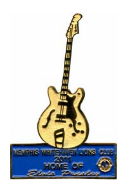
2011 Yellow Guitar