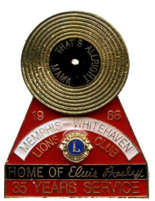
1988 Red Prestige "That's Alright Momma" 35 Years of Service

As with the first series of guitars, we made three prestige pins. They was a red one in 1988, a white one in 1990, and a blue one in 1991. Each one featured a spinning record.