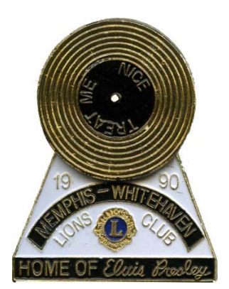
1990 White Prestige "Treat Me Nice"