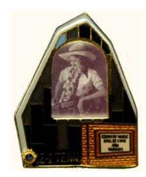
Patsy Montana 2000