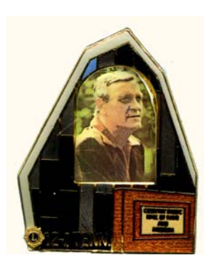
Eddie Arnold 1997