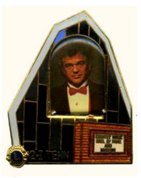
Conway Twitty 1993