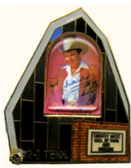
Little Jimmy Dickens 1991