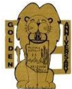
1973 V This is probably a cutout of the regular 1973 pin. If so, they did a good job.