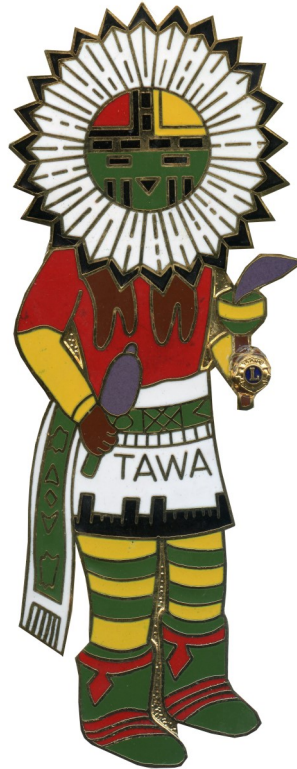
Bolo We assume our comments on the two pins to the left apply to this bolo.