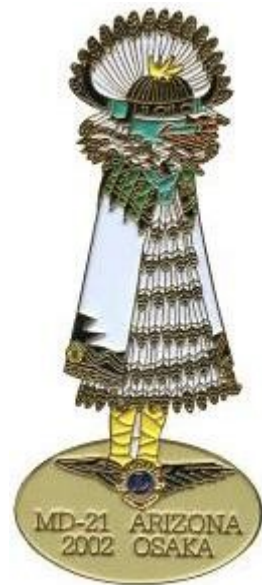
2002 P V

The black base pins beginning in 1999 through 2002 are numbered 25 through 28