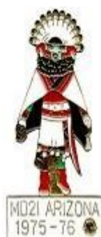
1976 V Die Strike

This issue was initially made in semi cloisonné with both a waffle back and a plain back. It was also made in die strike with a number 2 on the reverse. Like all of the others in this series it was reproduced.