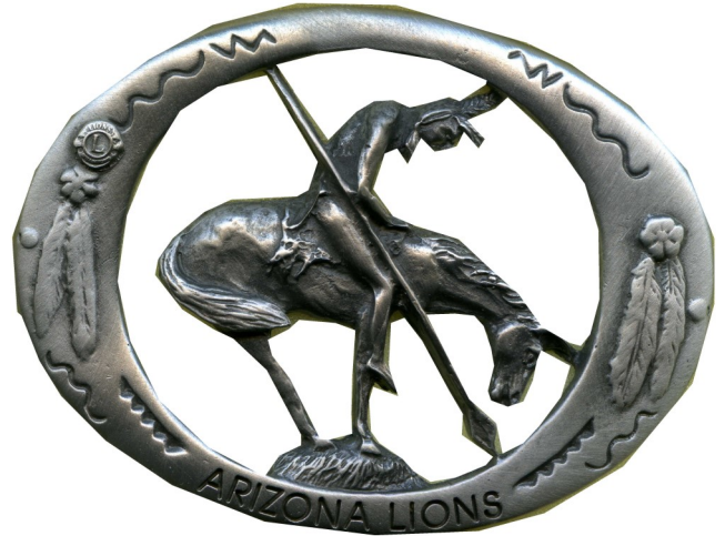
Unknown "ARIZONA LIONS" Pewter Indian