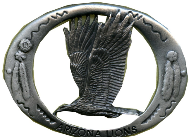
Unknown "ARIZONA LIONS" Pewter Eagle