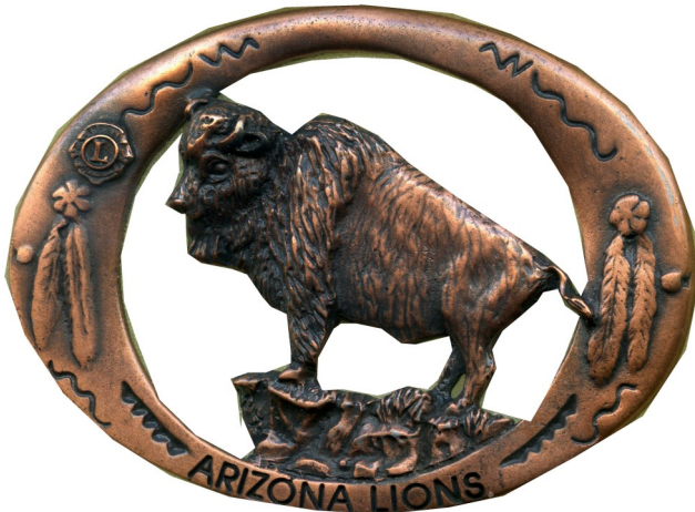
Unknown "ARIZONA LIONS" Bronze Buffalo