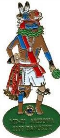
2008 P V

2008 Regular issue has minor color variations. Notice regular pin has two white stripes above blue sock. Variation has a brown stripe and a blue stripe.