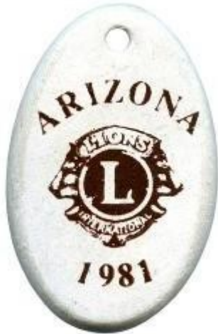
Key Fob 1981