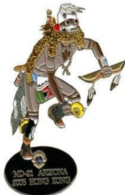
2005 P V