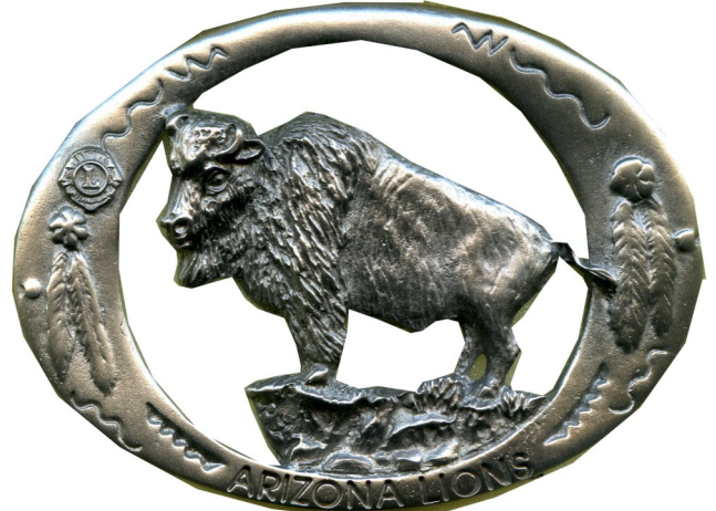
Unknown "ARIZONA LIONS" Pewter Buffalo