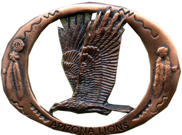
Unknown "ARIZONA LIONS" Bronze Eagle