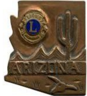
1967 Bolo V