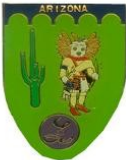
Unknown Lioness Pin