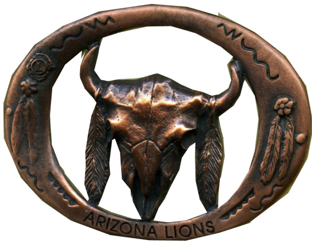
Unknown "ARIZONA LIONS" Bronze Buffalo Head