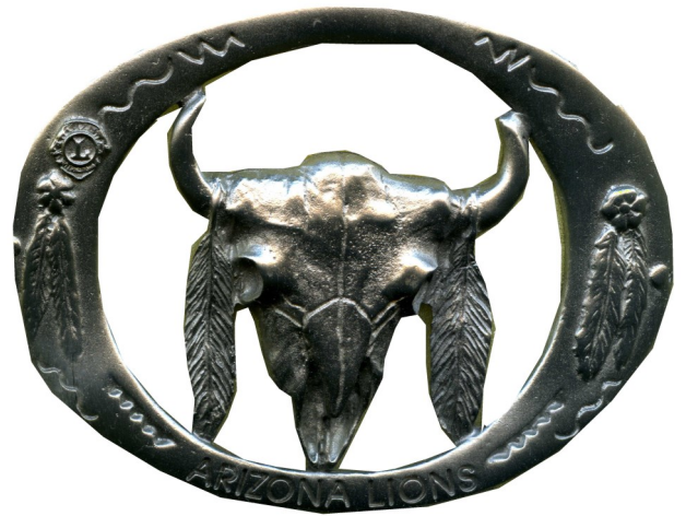
Unknown "ARIZONA LIONS" Pewter Buffalo Head