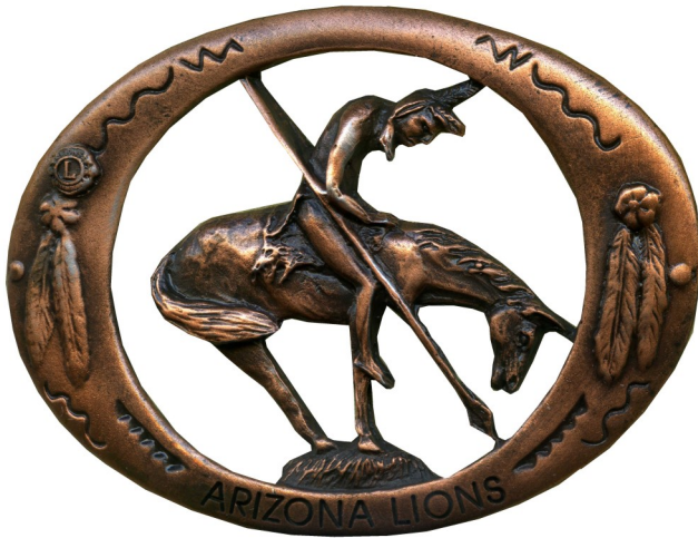
Unknown "ARIZONA LIONS" Bronze Indian