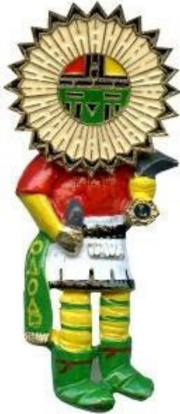
Early—Date Unknown Our sources tell us that these two pins were not issued by the Lions of Arizona. We are showing them merely for your information.