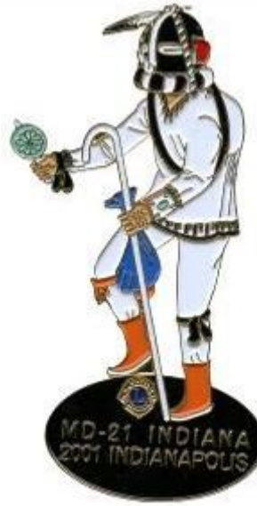
2001 P V

From 1977 forward MD 21 put the name of their state, Arizona, on their pins along with the City in which the International Convention was being held for that year. In 2001 the Convention was in Indianapolis, Indiana. They mistakenly put Indiana instead of Arizona on the first issue of the pins. They had to go back and correct it. Thus they had two sets of pins that year.. As they had done in several previous years they issued some pins with different colored bases.