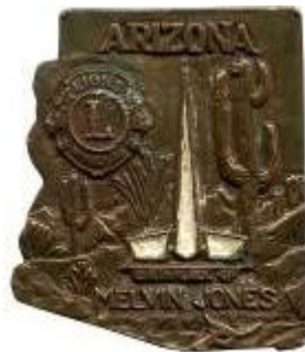
1968 P Bolo