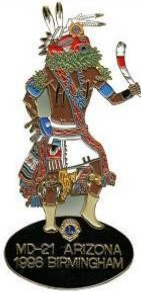
1998 P V