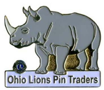
AT 1210 18 Bart Phillips (ID) The Rhinoceros