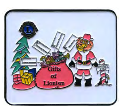
North Pole Lions Gifts of Lionism SA 0334