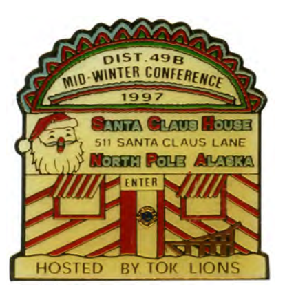
1997 North Pole Lions Mid-Winter Conference SA 0815