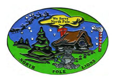
2003 North Pole Lions SA 0328