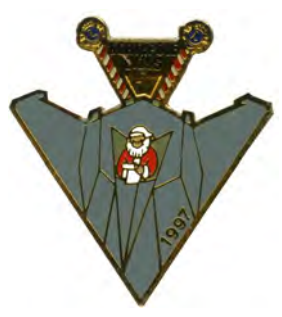
1997 North Pole Lions Gray Background Santa & His Notes SA 0697