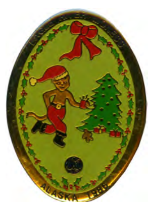
1986 Eagle River Lioness Merry Christmas SA 0831