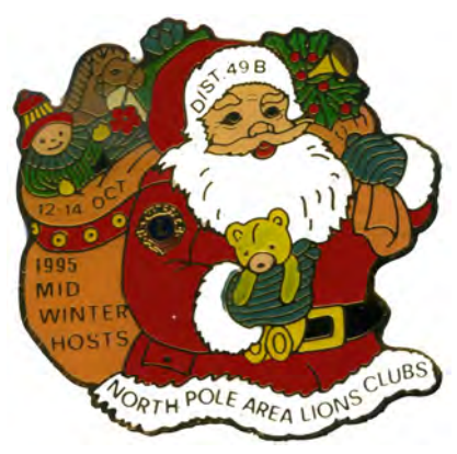
1995 North Pole Lions Mid-Winter Hosts Santa & His Toy Bag SA 0813