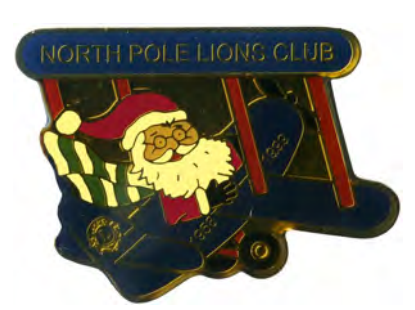
1999 North Pole Lions Santa & His Bi-Wing Airplane SA 1011