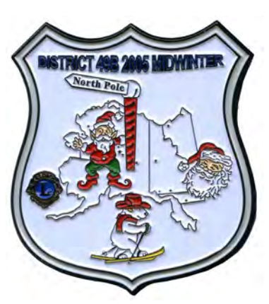
2005 District 49B SA 0332