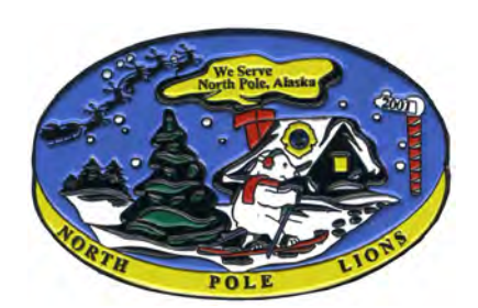
2001 North Pole Lions SA 0327