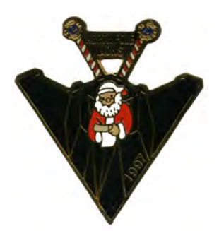
1997 North Pole Lions Blue Background Santa & His Notes SA 0698